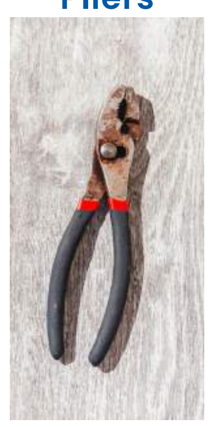
Tools needed: Pliers

Using a pliers disconnect white flex plumbing from "Y" valve at the hose bibb.