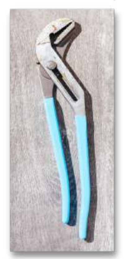
Tool Needed: Channel Lock (20 inches or larger)

If you have a Paramount or A&A Delta UV disconnect plumbing connection union with a channel lock (20 inches or larger) at the bottom of the UV like the photo below.